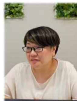
Ms. Maruta Gunze Medical

As a relatively new player in the adhesion prevention market, we are committed to training our sales team to listen and work closely with medical professionals. It is critical that we quickly expand our market presence and create an environment where our products are easily accessible and selectable by medical professionals throughout Japan.