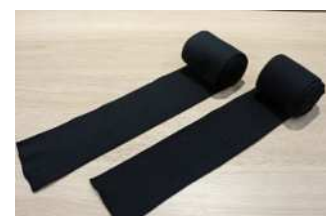
New tubular covers under development