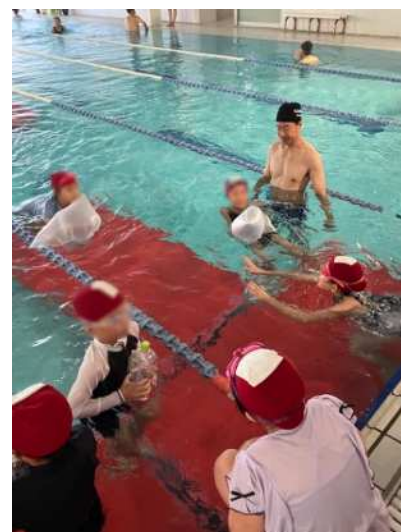
Swimming lessons at Gunze Sports Kyoto Yawata

Our curriculum is designed to minimize water-related incidents by incorporating critical safety training. This includes strategies for dealing with potential drowning situations, such as maintaining composure to avoid panic. Lessons also include practical exercises, such as using familiar objects (e.g., 2-liter plastic bottles) as flotation devices if staying afloat while awaiting rescue becomes difficult. Through these measures, Gunze Sports strives to improve safety and reduce the risk of accidents.