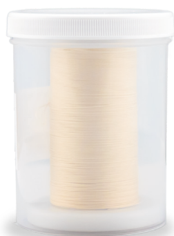
Retention of Tensile strength